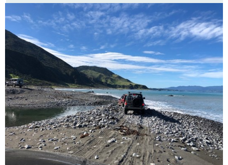
Getting very close to the tide