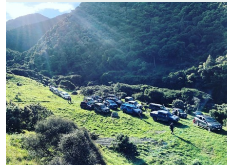
Mukamuka stream aka play area