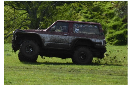
Hintzy - Speed section