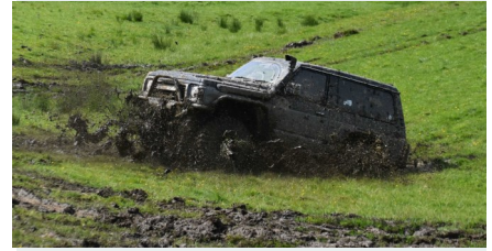
Brent Ward - Speed section