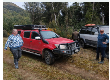
Stopping for morning tea at the top of Cruiser Drive