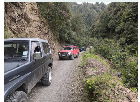
Fortunately we only had 5 trucks to turn