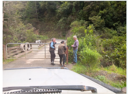
Thou shall not pass – troublesome lock at McGhies Gate

We then headed over to Cooks gate via Riverstone Drive and an uneventful drive to Orange Hut for lunch. This was followed by a drive to the Causeway, along Slippery Forest access road, up the Fenceline to Twin Gates, and then over to Maungakotukutuku gate. In the end, we used all 3 gates. A great day of learning and building confidence.