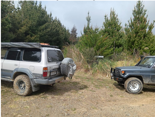
Two Cruisers admiring the Cruiser Drive sign