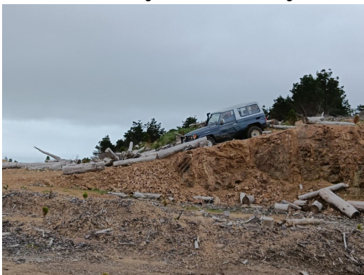
Descending from the top of Fenceline